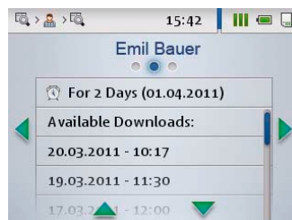
Detailed view of existing and due downloads