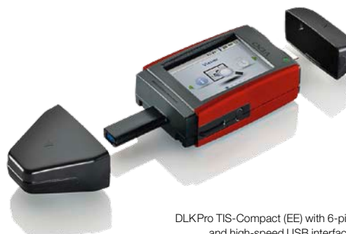
DLKPro TIS-Compact (EE) with 6-pin and high-speed USB interface