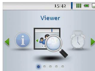
View data on the Key

Order no. for DLKPro Neoprene Case: A2C59514917